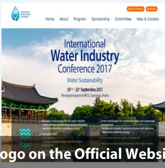
Logo on the Official Website