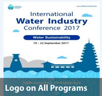
Logo on All Programs