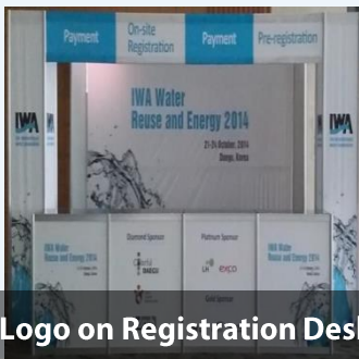
Logo on Registration Desk