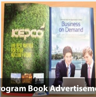
Program Book Advertisement